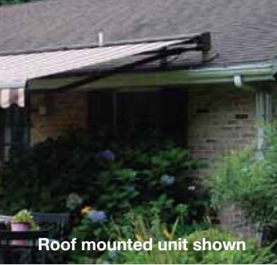
Roof mounted unit shown