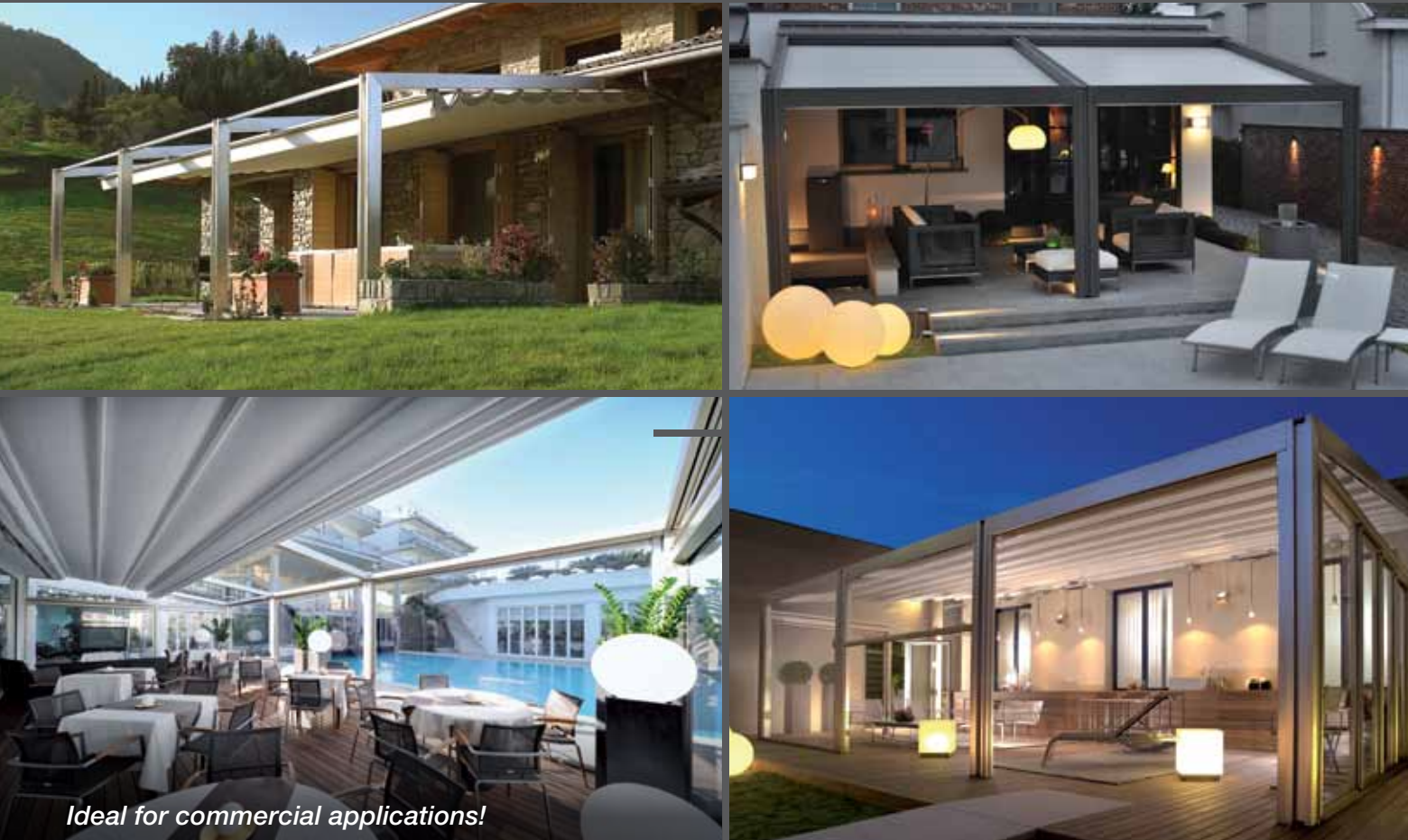
Ideal for commercial applications!

The growing trend American consumers express is their desire to dine outdoors. Customers simply love the open environment, but as with any outdoor living space, you are subject to all the elements Mother Nature sends forth. Too hot, too cold, pesky insects, and rain can all force you to under-utilize this premium space. For commercial installations, you will be surprised at how quickly a Pergotenda system will pay for itself. No more canceled outdoor events!